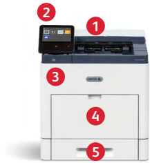
Xerox® VersaLink® B600 Printer Print.