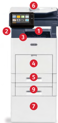
Xerox® VersaLink® B605 Multifunction Printer Print. Copy. Scan. Fax. Email.